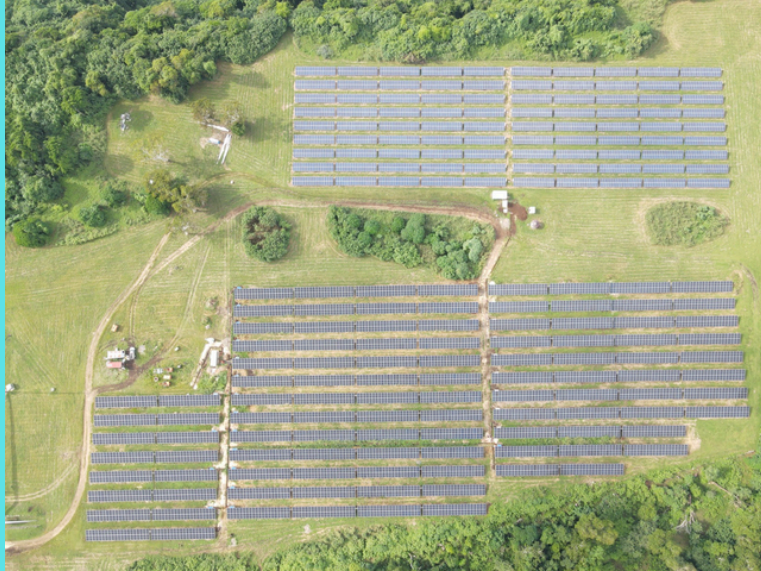
Kawene 3MW Solar Farm

UNELCO contracted Pacific Engineering Projects Ltd, a SEIAPI member to design and construct the largest solar PV farm in Efatae Island, Vanuatu. The successful completion of the Kawene 3MW Solar Farm represents a major step forward in Vanuatu’s transition to clean and sustainable energy. With an installed capacity of 3 megawatts (MW), this will contribute significantly to reducing reliance on diesel-based generation and supporting Vanuatu’s renewable energy targets.